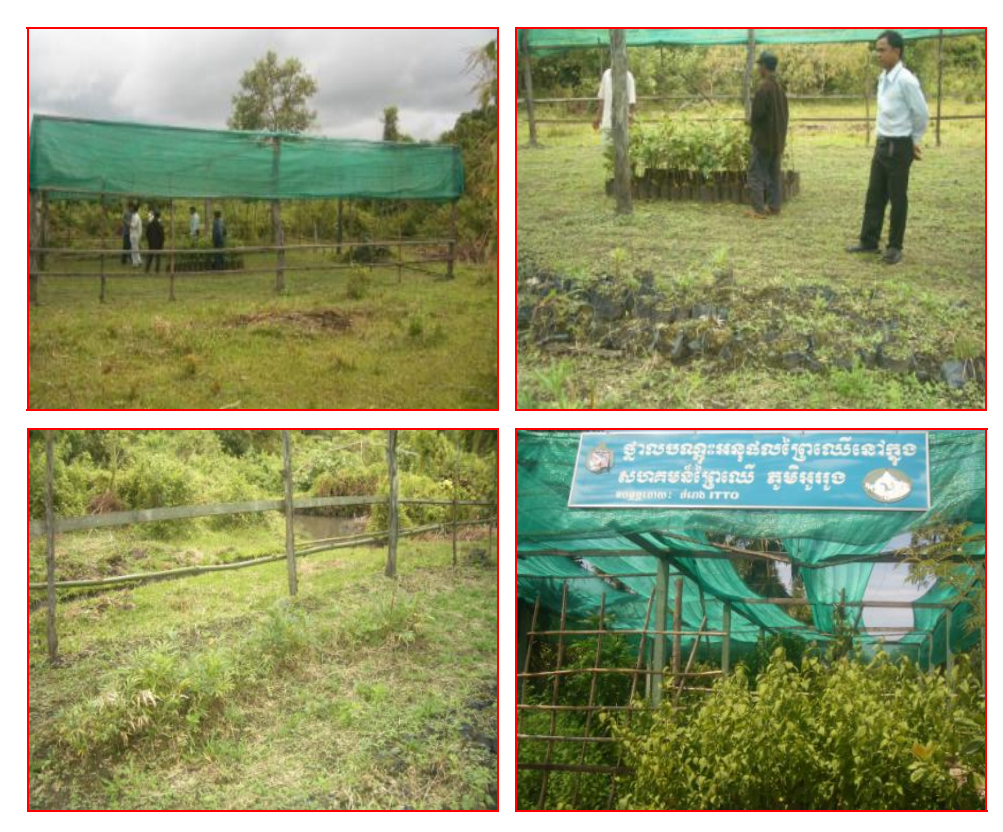
Un-tended nurseries of rattan and fruit trees at Som Trochas and Po Rung village of Ratanakiri and Kampong Chhnang provinces due to weakening interest in planting

Based on the information gathered through the field visits, impacts of the project intervention appear to be insignificant. While some processors still utilize the skills they leaned from the project, it does not contribute noticeably to livelihood. The strong interest in planting of NTFPs and fruit trees recorded in the past is now weakening due to the changing environment. If the impact of project intervention is to be sustained, there is an urgent need for the government to accord extended technical as well as financial assistance for the villagers in order to continue utilizing the skills acquired from the project.