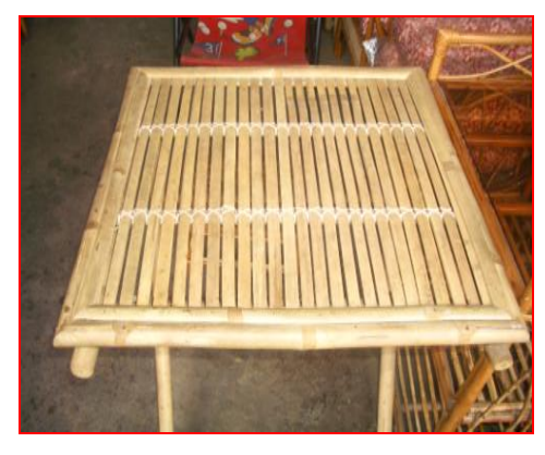
Lower grades of bamboo furnitures produced by trained processors at Kon Chung village of Kampong Chhnang province for sale at local markets