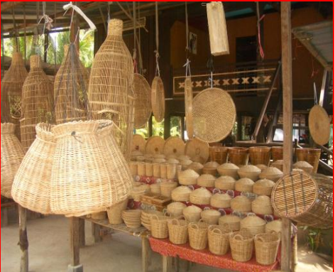
Upper grades of rattan handicrafts produced by company processors in Phnom Penh destined for urban and tourist buyers

After the project completion, the rattan processors were left by themselves without any external assistance in follow-up actions. The visits to the project sites suggest that these newly trained processors are in need of assistance in making use of the skills they have acquired; these local people are in need of support to survive during