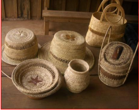
Law grades of rattan handicrafts produced by trained processors at Tum Or village for sale at local markets only